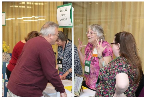
Maine Old Cemetery Association

There continues to be interest from organizations in signing up for the Society Fair, but only a limited number of tables are still available. We provide the table and two chairs, free signage and a captive audience. Don't wait. Contact SocietyFair@nergc.org for more information.