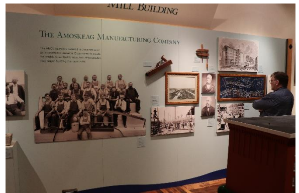
Amoskeg Mill Exhibit at the Millyard Museum

* The Aviation Museum is housed in the original 1930s terminal for Grenier Field, across from Manchester Boston Regional Airport. Its exhibits trace the history of aviation in New Hampshire from its inception to post-World War II. You can try a simulator, learn about some daring women aviatrix, and lots more. www.aviationmuseumofnh.org .